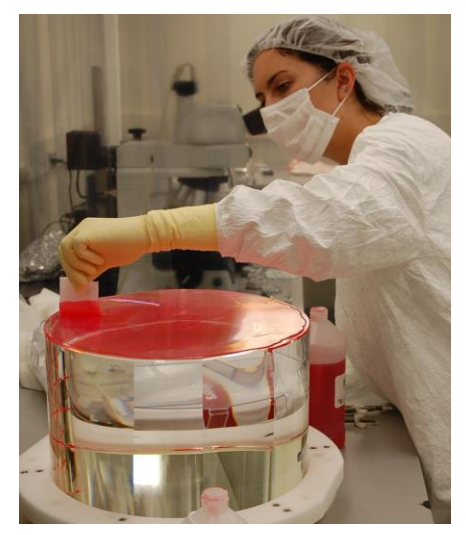
Figure 3: Spreading FC onto a tests mass with a Berkshire lens tissue 4.3 Brush on Application for Small Optics (≤2" diameter)

8. Remove the same way as vertically applied FC.