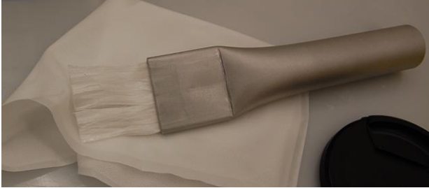
Figure 1: 1" aluminum handled nylon brush from Gordon Brush.